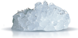
BFM 800 AS/WS on BIN 55