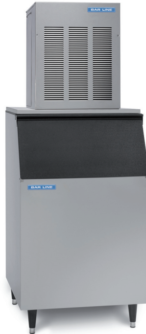
BFM 1256 AS on BIN 55

Bar-Line Equipment range is the well-known EU-made line of ice machines used and appreciated by many for its reliability. Built in the Italian manufacturing plant of Frimont Spa, ISO 9001 Certified, these units are built with sturdy, corrosion resistant stainless steel, and feature European-made components to assure maximum ice-quality and machine longevity. Quality tested one-by-one, the Bar-Line self-contained units feature a well balanced ratio between production and storage capacity, alongside with reduced outer dimensions that allow for built-in installations. Contemporary, elegant design unites excellent operational features with the reliability obtained through years of successful experience in ice making technology.