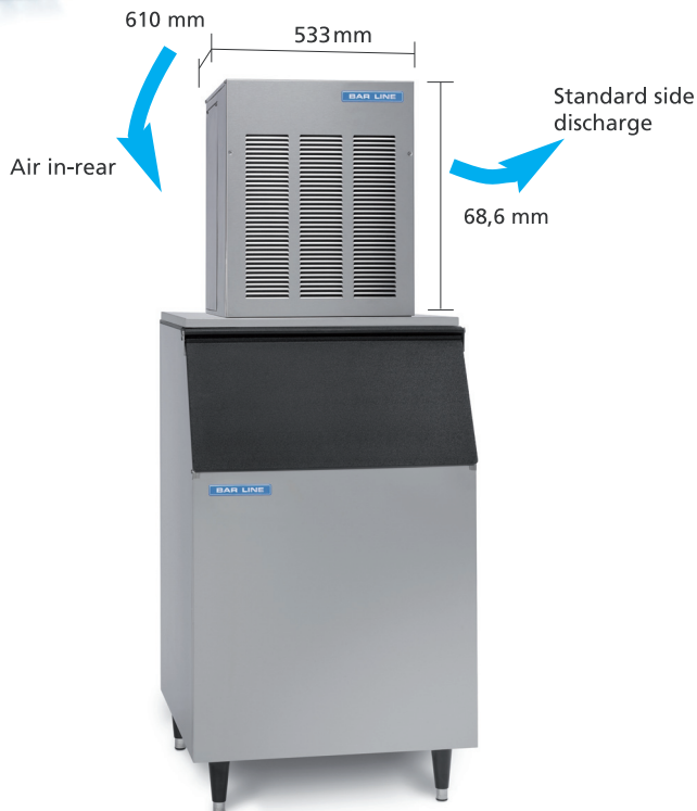
BFM 1256 AS on BIN 55