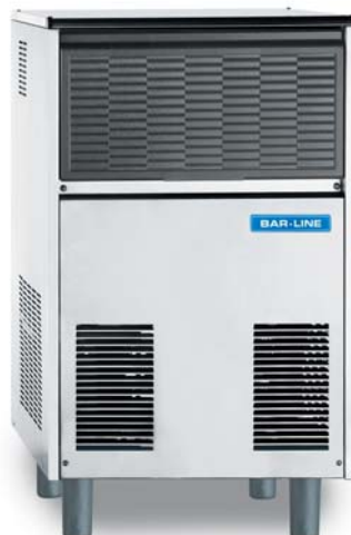
BF 80 AS/WS

Bar-Line Equipment range is the well-known EU-made line of ice machines used and appreciated by many for its reliability. Built in the Italian manufacturing plant of Frimont Spa, ISO 9001 Certified, these units are built with sturdy, corrosion resistant stainless steel, and feature European-made components to assure maximum ice-quality and machine longevity. Quality tested one-by-one, the Bar-Line self-contained units feature a well balanced ratio between production and storage capacity, alongside with reduced outer dimensions that allow for built-in installations. Contemporary, elegant design unites excellent operational features with the reliability obtained through years of successful experience in ice making technology.