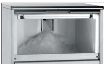
BF 80 AS/WS

All units have stainless steel finish. Refrigerant: R-134a