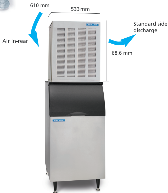
BG 655 AS on BIN 42