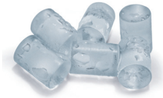
BG 655 AS on BIN 42