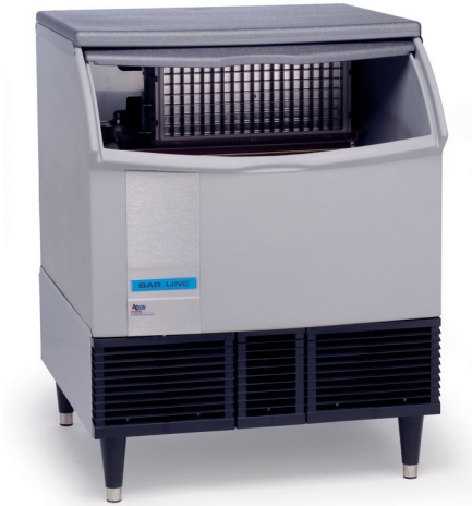
BS 305 AS

Bar-Line Equipment range is the well-known EU-made line of ice machines used and appreciated by many for its reliability. Built in the Italian manufacturing plant of Frimont Spa, ISO 9001 Certified, these units are built with sturdy, corrosion resistant stainless steel, and feature European-made components to assure maximum ice-quality and machine longevity. Quality tested one-by-one, the Bar-Line self-contained units feature a well balanced ratio between production and storage capacity, alongside with reduced outer dimensions that allow for built-in installations. Contemporary, elegant design unites excellent operational features with the reliability obtained through years of successful experience in ice making technology.