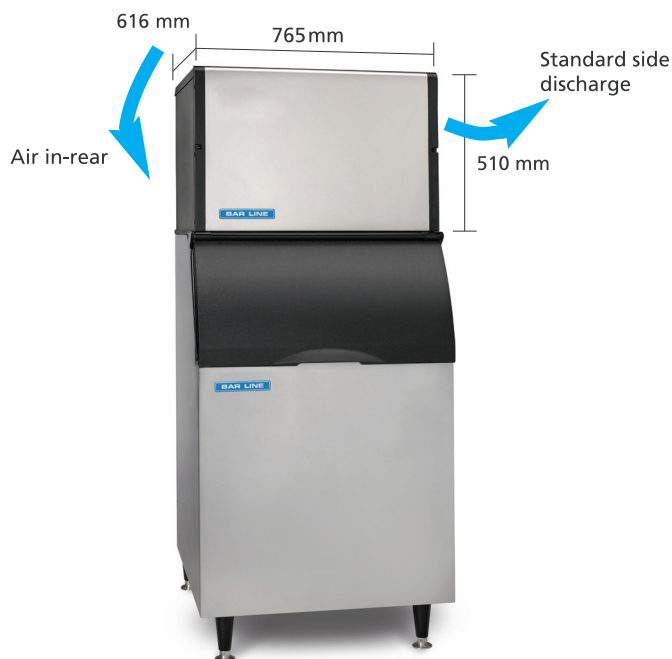
BM 605 AS on BIN 550