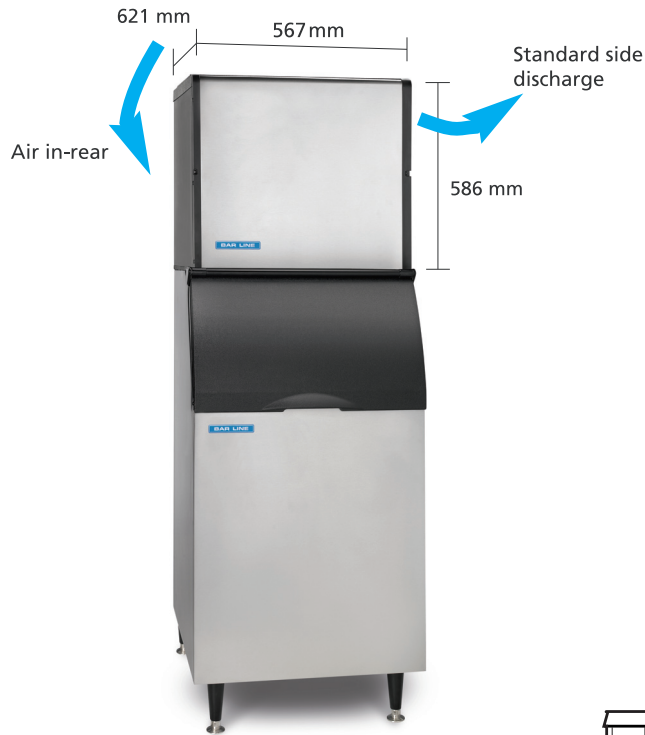
BM 325 AS on BIN 42