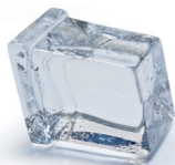
BM 1005 AS on BIN 55