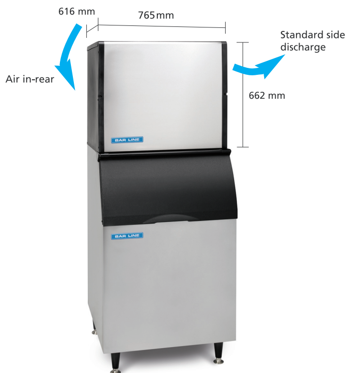
BM 1005 AS on BIN 550