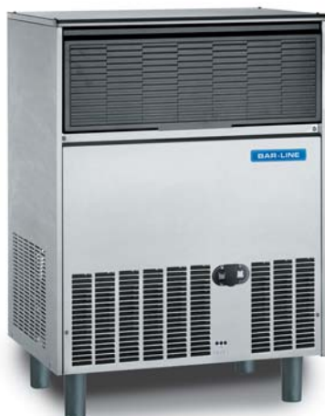
B 9550 AS/WS

Bar Line Equipment range is the newly released EU made ice makers for Thimble-shaped rounded ice cubes coming from Bar Line.