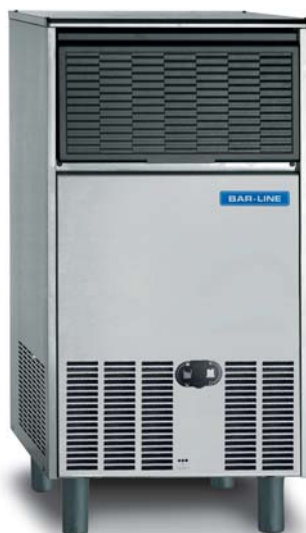
B 7540 AS/WS

Bar Line Equipment range is the newly released EU made ice makers for Thimble-shaped rounded ice cubes coming from Bar Line.