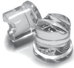
B 5022 AS / WS

Also available in the self-contained range for "Bistrot" cube: B 2006, B 2508, B 3008, B 3015, B 4015, B 6022, B 7540, B 9040, B 9550 See pertaining literature for more details