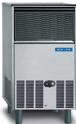
B 5022 AS/WS

Bar Line Equipment range is the newly released EU made ice makers for Thimble-shaped rounded ice cubes coming from Bar Line.